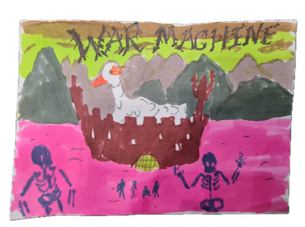
Dungeons & Dragons and Album Covers

I saw the "From Glasgow to Avernus" oneshot last night.