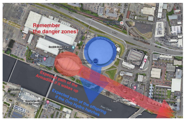
- Pat Hall